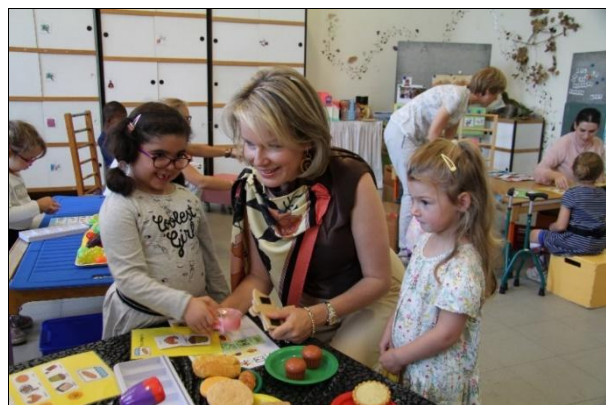
Chatting with children in the kindergarten class

The first part of the visit was dedicated to the school where 60 children are welcomed and taught every day. They were all extremely impressed by this royal visit they will never forget. Queen Mathilde indeed was extremely simple and natural, listening to all, asking questions and having private discussions with many children.