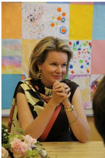
The Queen listening to the Staff introduction

Two weeks later, we were delighted and honoured to welcome the Queen, once again, to celebrate the 50th anniversary of a school for physically disabled boys and girls, from 2 to 12 years, named « La Famille ». Being the vice-president of this organisation, I had the privilege to welcome the Queen with local authorities, President and staff of the school.