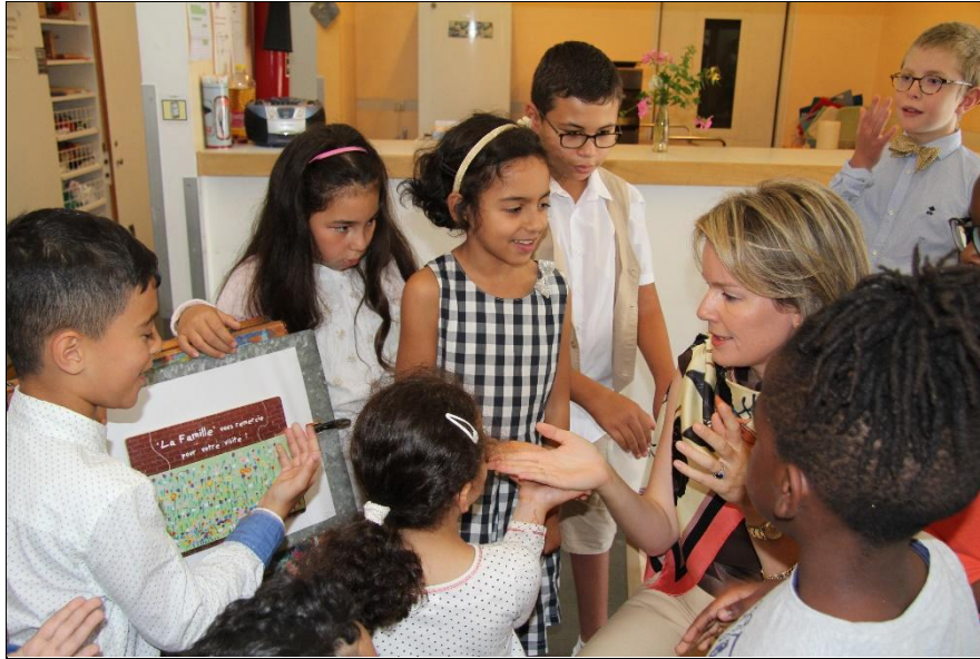
The Queen receiving a souvenir from her visit to the school

During the second part of her visit, the Queen had the opportunity to meet the 17 adults coming every day at the disabled day center to have occupational activities.