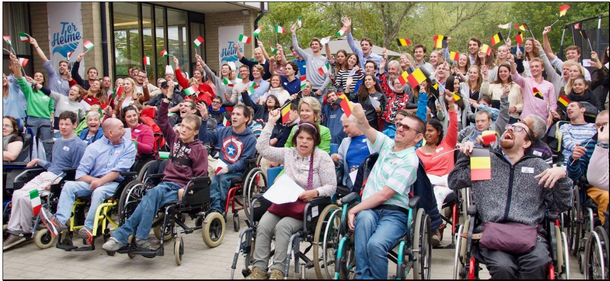
The Queen left after a photo souvenir with the whole group

During her short visit, Queen Mathilde has been deeply impressed by the various types of activities organised for the campers (painting, paper flowers creation, pictionary, etc.) with an active participation of everyone.