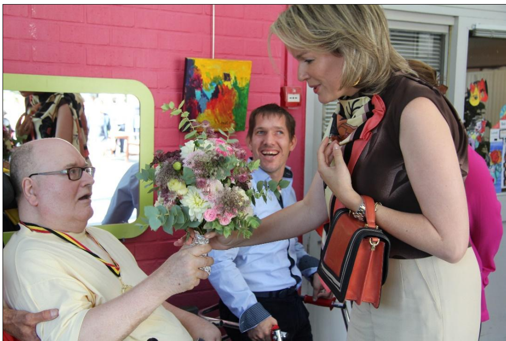
Queen Mathilde having decorated this gentleman who is at La Famille since 50 years!

On top, she met a man who celebrated his 50 years anniversary with the Center where he arrived, as a child, when he was 5 years old.